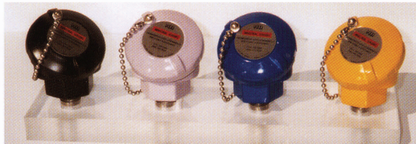
OPTIONAL COLOR CODED HEADS